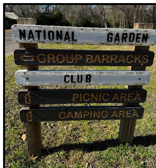
On the right - Sign that the Park puts up.

Nancy Galloway presented program with slide show on the Monarch butterfly conservation effort, "Monarchs in the Air" . Sharon Wegenhoft also attended the School.