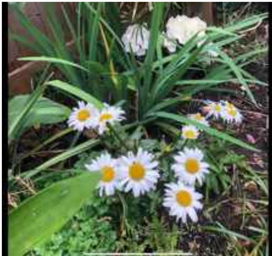
From Sylvia Drew's garden

MON, SEPT 16, 8:30am- 11:00am. Free tour of Genoa Friendship Gardens, 1210 Genoa Red Bluff Road, Houston. Tour a variety of planting exhibits, meet, and talk with Harris County Master Gardeners. hcmga.tamu.edu